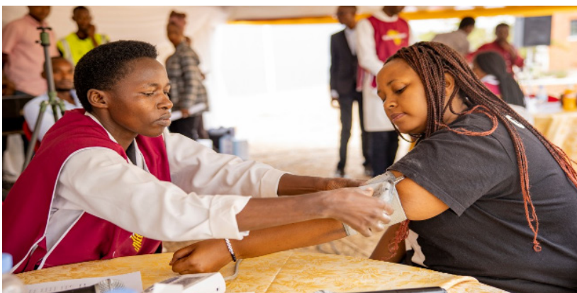
Figure 1. Health providers taking blood pressure measurements during the Healthy Heart Africa project launch in Kigali, Rwanda, in 2022

Cite this article as: Ukuri et al. Concurring the Silent Killer: How to improve hypertension management through Innovative Knowledge Systems in Nyamasheke District, Rwanda. Rw. Public Health Bul. 2024, 5 (2): 51-57. https://dx.doi.org/10.4314/rphb.v5i2.4