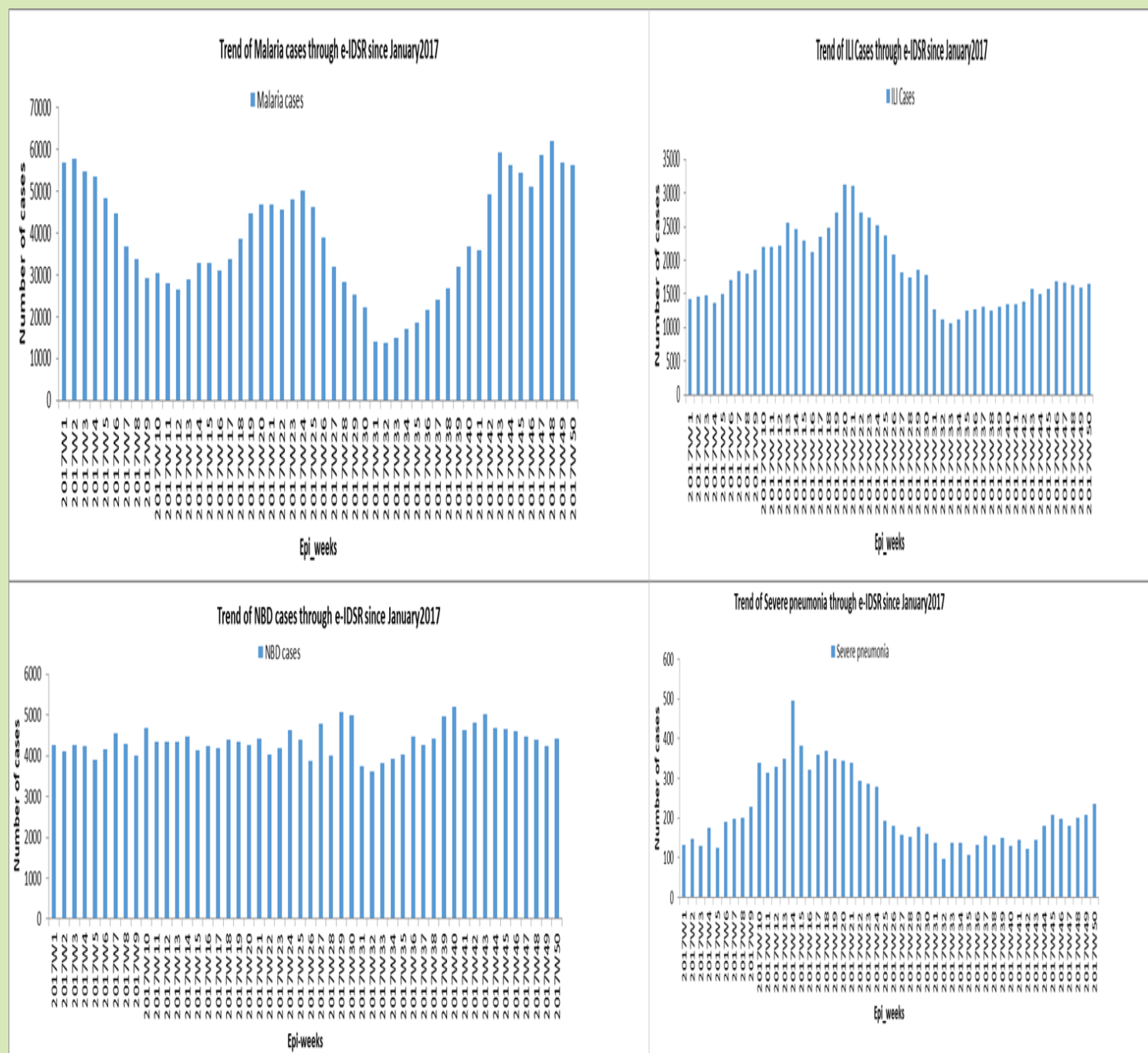
Fig 2. High morbidity diseases through e-IDSR in Rwanda