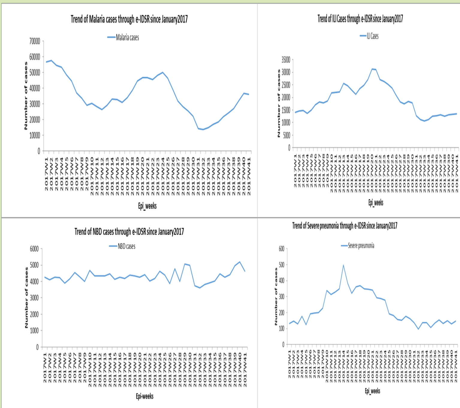
Figure 1. High morbidity diseases through e-IDSR in Rwanda