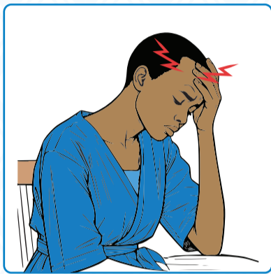
High fever above 38° Celsius